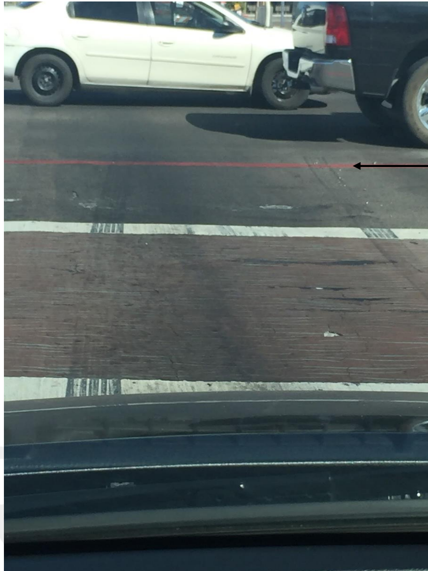
Figure 2: Actual Line of Prolongation